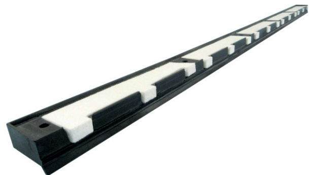
LubriGuard: Shown with open back

Self-lubricating, environmentally friendly LubriGuard wipers are now available as moulded wipers, wipers for linear bearings and in standard lengths. The capillary effect ensures that less lubricant is needed, fewer refills being required.